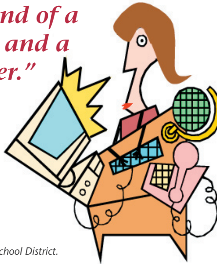
Illustration courtesy of Kent School District.

Temperature standards are important because lowering thermostats just one degree results in a three percent savings on the heating bill, says Moen. At Kent schools, heating controls are set at 69 degrees for classrooms and 65 degrees for hallways and common areas. Building occupants are allowed to temporarily change the temperature setting by up to three degrees.